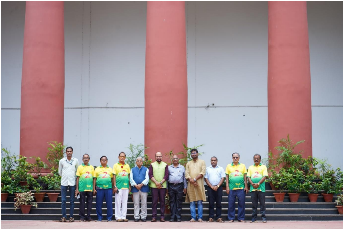
Friendship Day Celebration at Apna Ghar