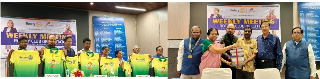
Last week's events